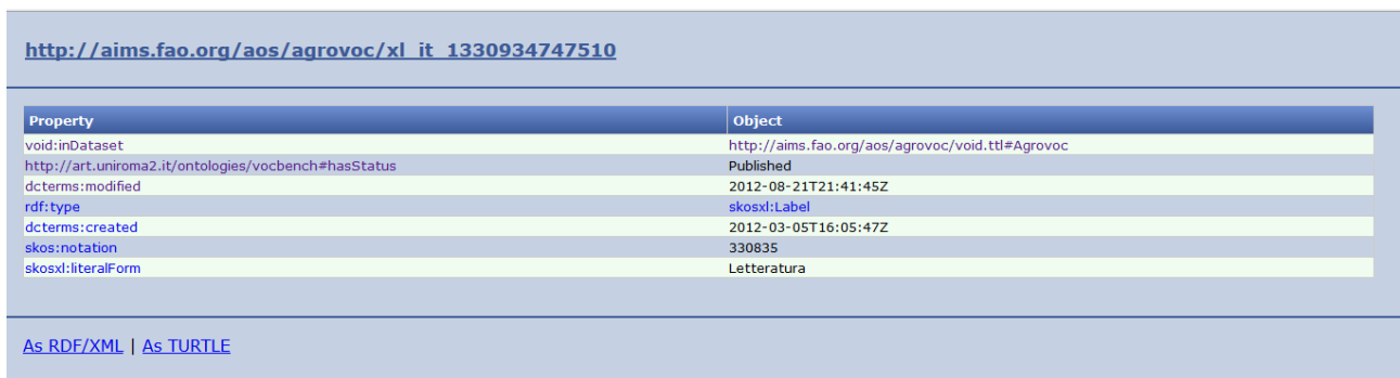
Figure 2: skosxl:Label description

The footer contains two links "As RDF/XML" and "As TURTLE" obtained by the DispatcherBean's method getLinkForFormat().